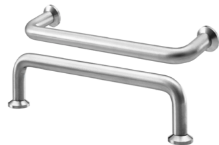
NYDALA HANDLE 004.496.36

AR+ is a High Gloss HPL with a superior scuff and mar resistance and therefore usable on vertical and horizontal surfaces. Formica's own laboratory tests show remarkable results. It has also been tested externally by LGA Institute with official certification of AR+ superior performance.