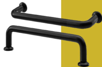
BAGGANÄS BLACK HANDLE 803.384.13