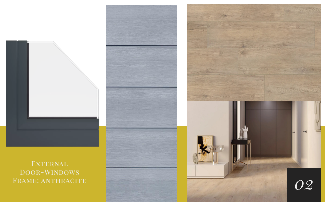
EXTERNAL DOOR-WINDOWS FRAME: ANTHRACITE

Additionally, we invite you to discover our flooring solutions, guaranteeing not only durability and easy maintenance but also elegance and unique design. Whether you're looking for modern facade panels or high-quality wooden flooring, our catalog provides a wealth of options to ensure your interior and exterior reflect your personal style and taste.