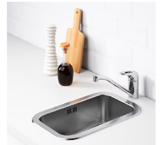
BOHOLMEN KITCHEN SINK 991.575.01