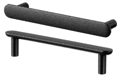
NYDALA HANDLE 004.496.36