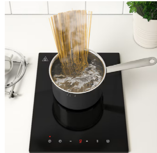
LAGAN INDUCTION HOB 605.055.68