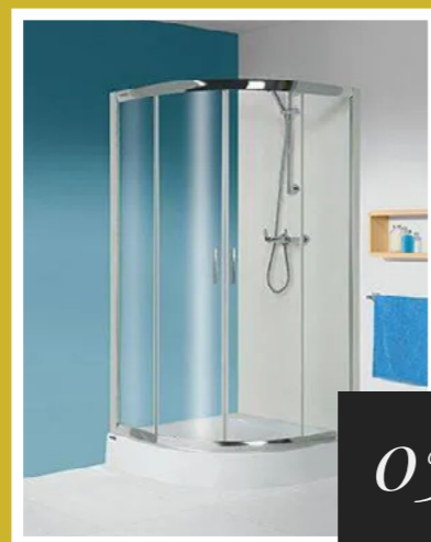
ALPINIA SHOWER FAUCET BGA_040M HANSGROHE CROMETTA SHOWER SET