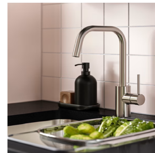
ÄLMAREN KITCHEN FAUCET 004.551.61