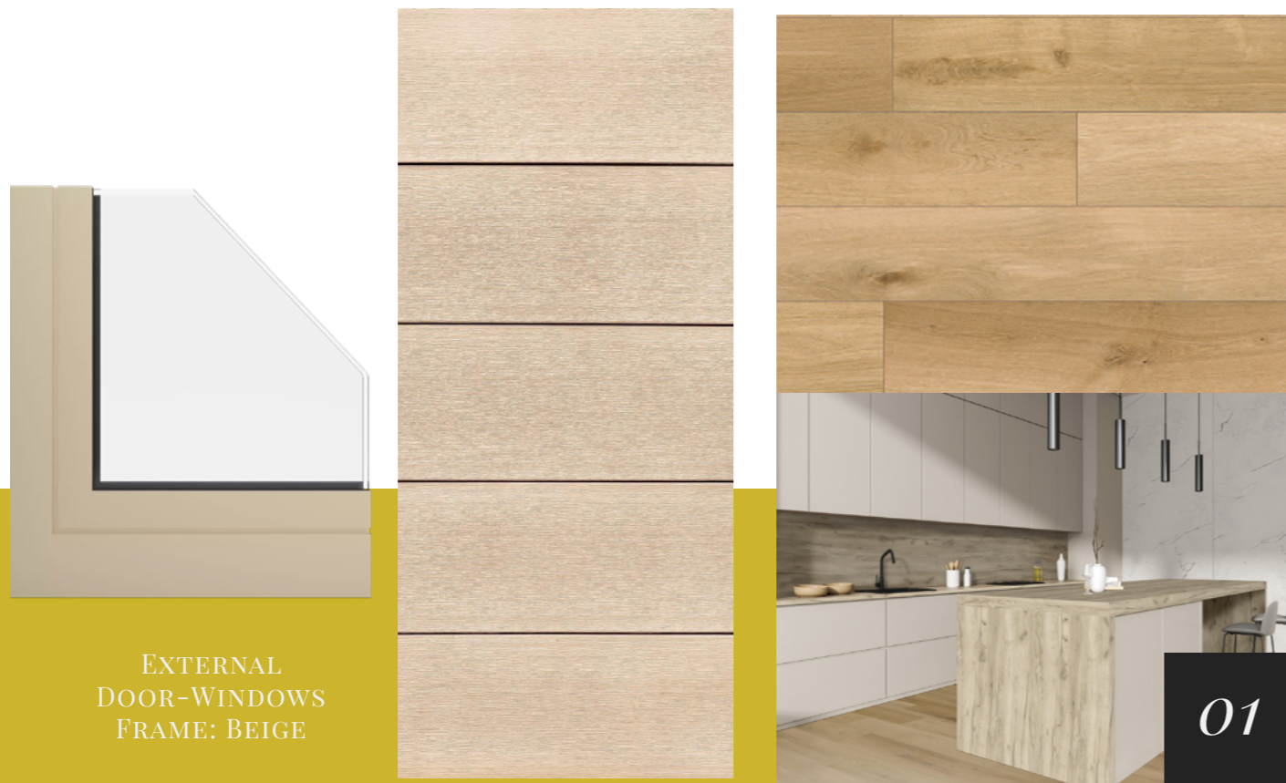
EXTERNAL DOOR-WINDOWS FRAME: BEIGE

Welcome to explore our wide range of products for external facade, offering high quality and aesthetic appeal to give your home a distinctive character. Our facade products come in various patterns, colors, and materials, allowing you to customize them to match your individual preferences and architectural style.